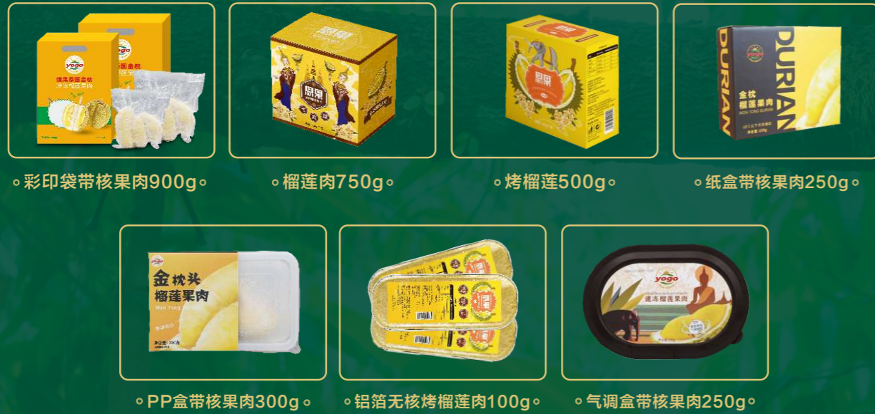
◦彩印袋带核果肉900g◦ ◦榴莲肉750g◦ ◦烤榴莲500g◦ ◦纸盒带核果肉250g◦ ◦PP盒带核果肉300g◦ ◦铝箔无核烤榴莲肉100g◦ ◦气调盒带核果肉250g◦