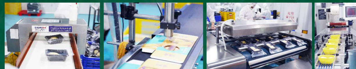
◦ 金检机 ◦

L-type vertical full-automatic sealing machine, using integral steel knife, the machine adopts the operation interface of color touch screen, the control panel is easy to operate, the conveyor belt speed is 32 meters/minute, the maximum speed is 40-60 bags/minute, the production packaging is more smooth, and the effect is more beautiful.